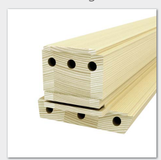
Head and longitudinal drilling for dowel connection

The machine is designed for standard operations in window and door manufacturing but the machine can be modified for customer-specific solutions using various accessories.