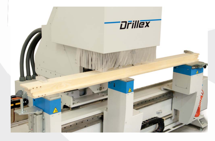
Three top vertical and three horizontal heads for milling and drilling

Exchangeable drilling heads for handle and window hinges